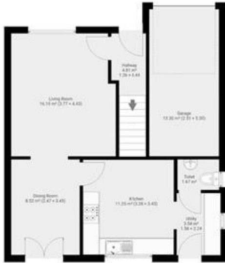
Ground Floor Gross Internal Floor Area - 59.25m2