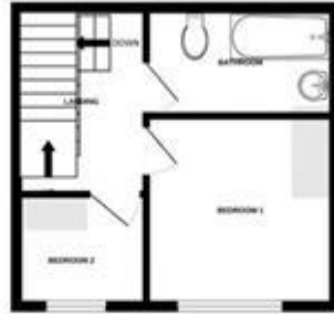
1ST FLOOR 264 sq ft. (24.3 sq.m.) approx.